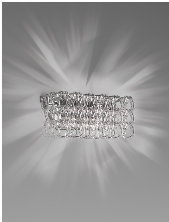
GIOGA AP 2 CRTR CR E27 CE